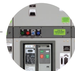
Type 2B secondary compartment

Increased reliability with modular design allows for reduced parts for both structures and breakers