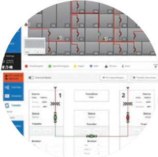
Low voltage switchgear elevation and one line view