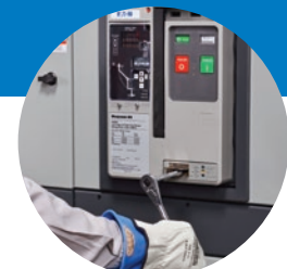
Levering Magnum DS breaker through the door

Lower installation and maintenance costs, higher interrupting and withstand ratings, enhanced safety, higher quality, reliability and maintainability