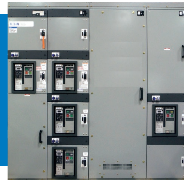
Shown without plenum. Plenum and duct can be added upon request.

Increased reliability with modular design allows for reduced parts for both structures and breakers