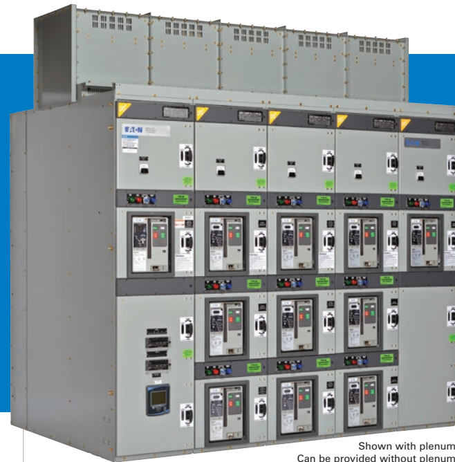
Shown with plenum. Can be provided without plenum.

Improved maintainability with dedicated secondary terminals with separate access door and front accessible control wireway